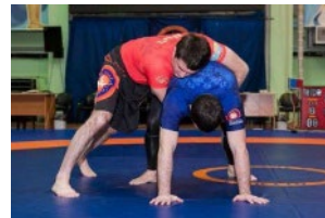
There aren't 3 points of contacts between knee and arms