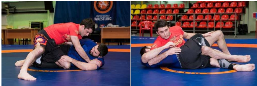
Example of Half guard

Half-guard is the guard position where the athlete on bottom position has one of the top athlete's legs trapped between his legs.