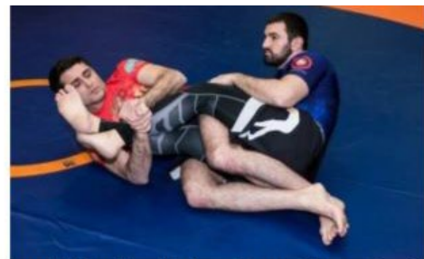
Opponent defending the kneebar and leg not extended