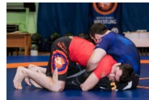
Back more than 90° from the ground