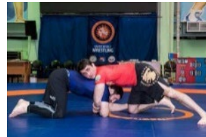
Athlete has not passed behind the control of the arms