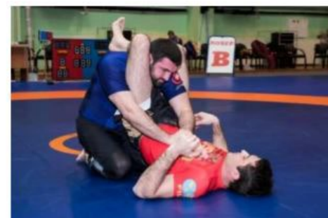
Loose triangle attempt with opponent defending