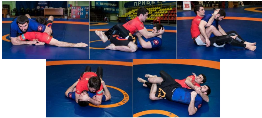
Neck cranks or Spinal Lock