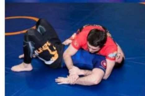
Kimura attempt with the arm NOT bent behind opponents back and opponent defending