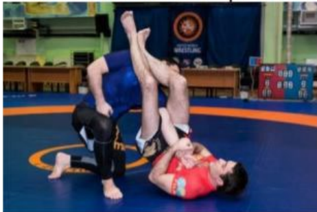
Armbar with arm stretched past 90