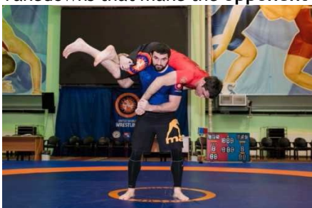
Example of 3 points Amplitude Takedown

Takedowns that make the opponent fall on his/her neck or head are illegal (art. 42 Illegal holds and actions)