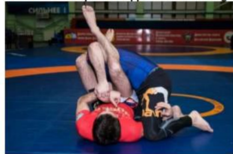
Armbar attempt with opponent defending