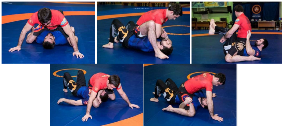
Example of position that are NOT Full Mount

2 arms under the legs; knee not on the ground; facing the leg; mounted triangle; leg above armpit level