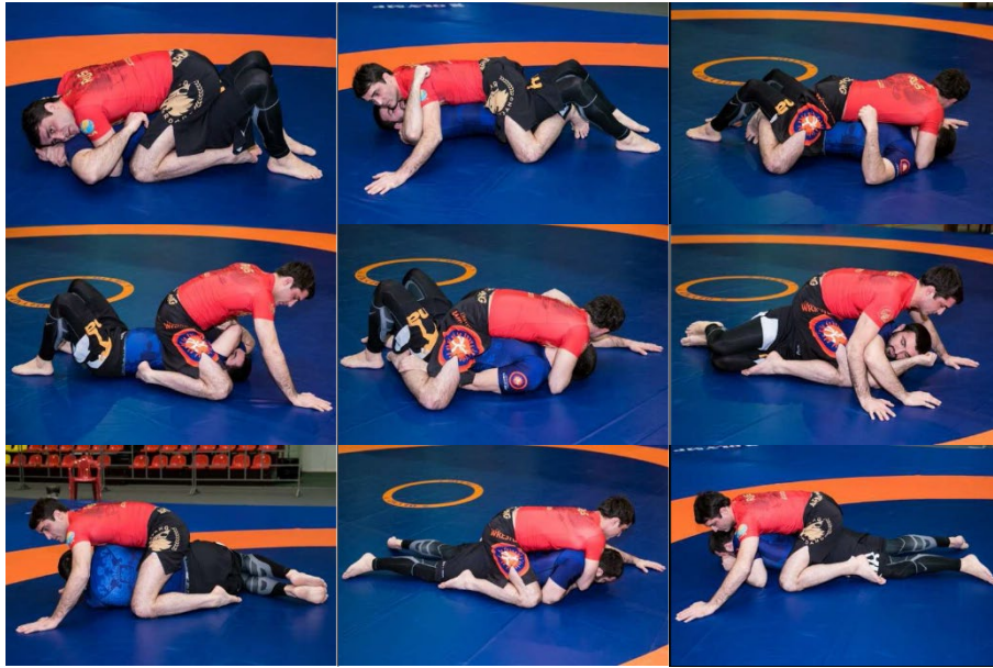
Example of Full Mount