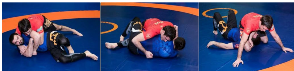
Example of position that are NOT Side Mount (i.e. back more than 45 from the mat, chest not facing or touching the opponent body like in a mounted triangle)