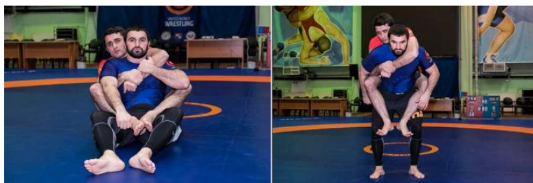
Example of Back Mount

Back mount position is the only dominant position that can be scored on a standing opponent or from a bottom position.