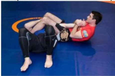
Armbar with arm stretched past 90°