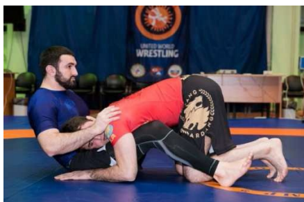
Example of Open Guard

Open guard is when the athlete on bottom position uses both of his legs to prevent the opponent from achieving a dominant position, without closing his legs around the opponent's body (in that case it is considered Closed Guard).