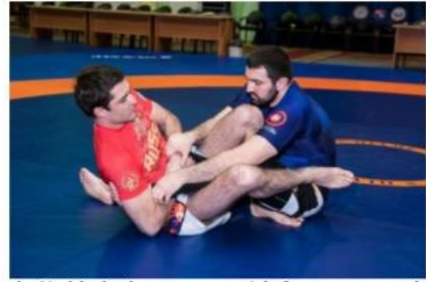
Footlocks/Ankle locks attempt with foot not stretched and opponent defending