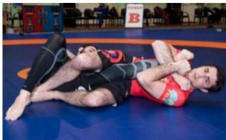
Kneebar hyperextending the joint