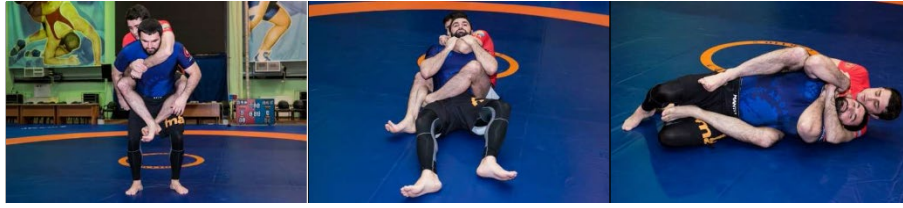
Example of positions that are NOT Back Mount (i.e. feet crossed; body triangle; feet not inside the opponent)

NOTE: It is not considered control if one of the feet is completely trapped between the opponent's thighs.