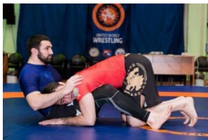
Back less than 90° Degree