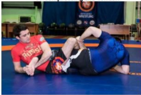
Toe Hold with torsion toward opponent back