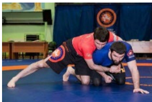
There are 3 Points of contacts between knee and arms