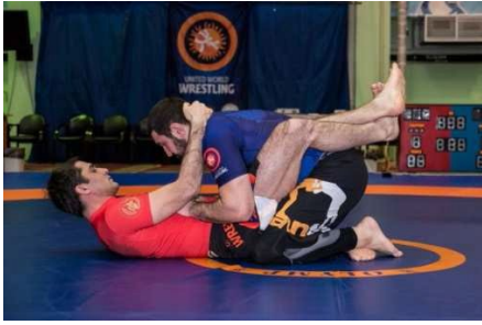
Example of Closed Guard