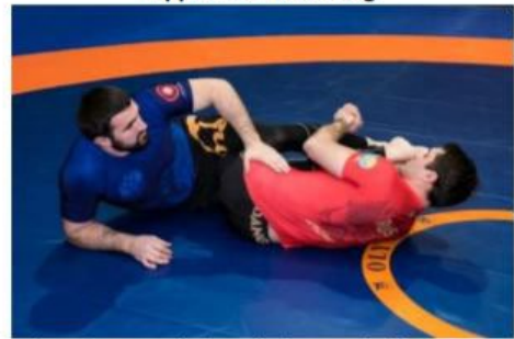
The foot is extended and the toe hold not secured