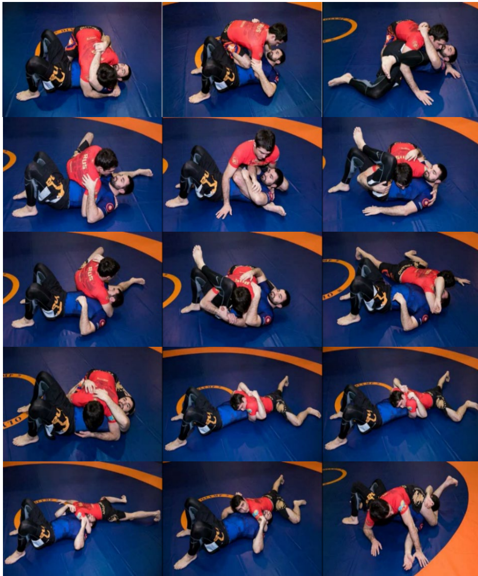
Example of Side Mount