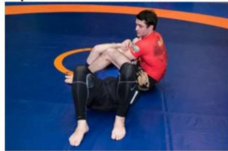
Armbar attempt with opponent defending