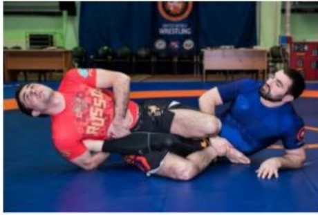
Footlocks/Ankle locks completely stretching opponents foot or compressing the tendon